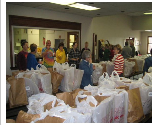
The Holy Cross Jesse Tree elves taking a break.