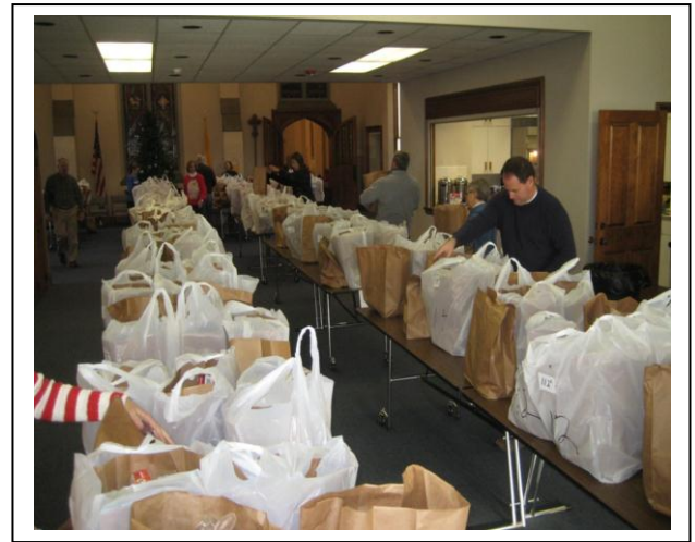
Pictured are some of the food gift bags which contain canned as well as fresh fruit and veggies along with a ham. Each bag is numbered and the numbers correspond to bags of gift items