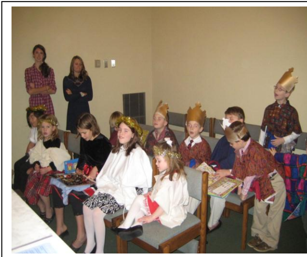
Angels and shepherds assembling in the chapel before the children's Mass